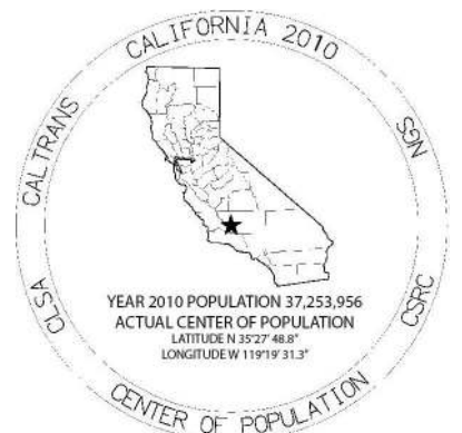
2010 Center of Population Monument