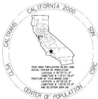
2000 Center of Population Monument Buttonwillow Rest Area