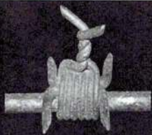
Miller six point barb (11-1043 B) 1876